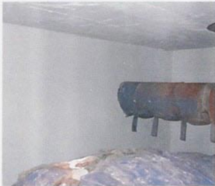
After repair mortar is allowed to cure, walls and ceiling are protected with FX-460 Primer and two coats of FX-460 Breathable Masonry Coating. Vault is structurally rehabilitated.