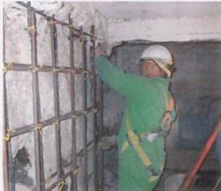
View of new reinforcing steel being placed. New and existing steel is coated with FX-408 Zinc Rich Primer for added protection and increased bond.