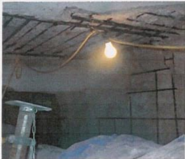
Steam vault is located under downtown Baltimore street level. View of deteriorated concrete walls and ceiling with exposed reinforcing steel.

Fox Industries, Inc. • 3100 Falls Cliff Road • Baltimore, Maryland 21211