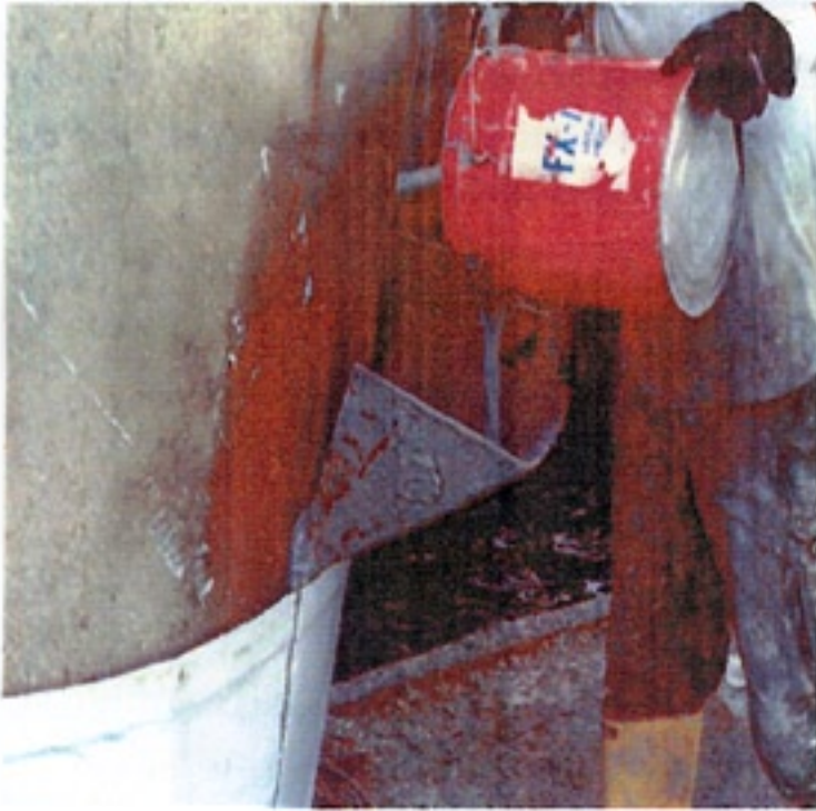
Close up view of FX-70-6 Epoxy Grout being poured using special fiberglass funnels manufactured by Fox Industries. Note: Flange constructed at top of jacket facilitates placement of grout into 1/2" annular void.