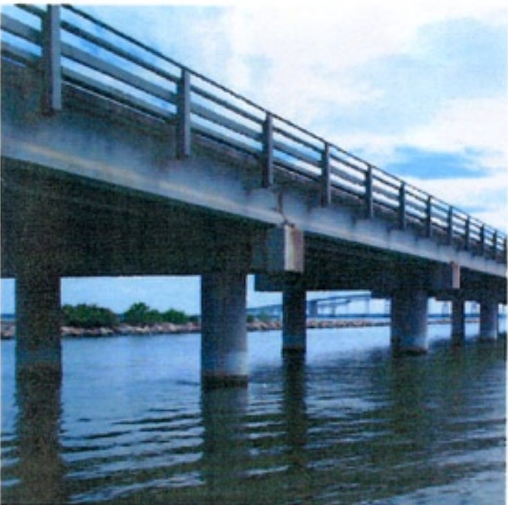
Jackets were inspected in 2002 and found to be performing as intended.