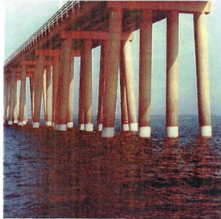
FX-70-6 Hydro-Ester® Pourable Grout displaces water and bonds tenaciously to both pile and jacket.